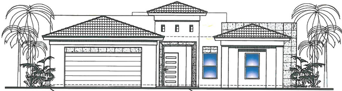
FRONT ELEVATION SCALE: 1/8" = 1'-0"